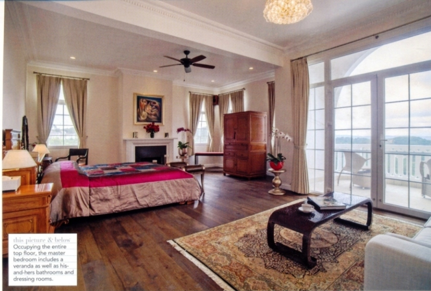
this picture & below. Occupying the entire top floor, the master bedroom includes a veranda as well as his- and-hers bathrooms and dressing rooms.